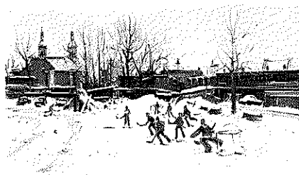
POINT ST. CHARLES, 24" x 36"

on the ice. "When I was younger, my motivation was my family," he said. I have five kids and I just worked my ass off. I still do."