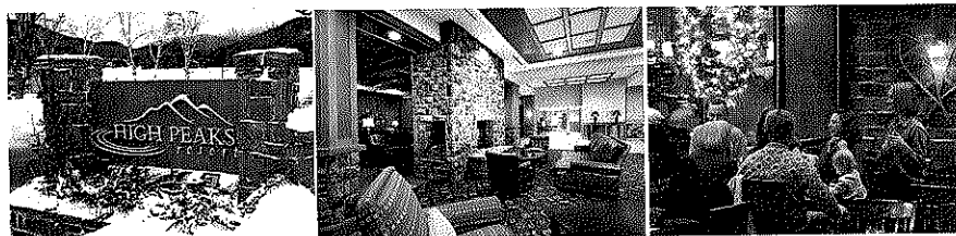
ABOVE: The entrance to the High Peaks Resort, its lobby and Dancing Bears Restaurant.

Our final day in Lake Placid was spent skiing and snowboarding at Whiteface Mountain. The gondola ride with views of the surrounding Adirondacks was breathtaking. Lake Placid is a gold medal vacation destination for residents of the National Capital Region. With a variety of outdoor activities to suit any ability, gourmet restaurants and boutique shopping, this friendly and quaint town has no shortage of things to do. ■