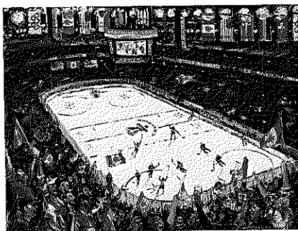
THE GOLDEN GOAL, 24" x 30"